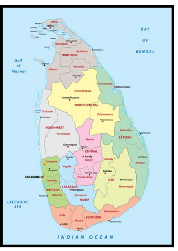
Figure 1. Map of Sri Lanka

The project "Hidden Challenges: Sexual Bribery Experienced by Female Heads of Households, including Military Widows and War Widows, in Sri Lanka to Enable Resilience and Sustained Peace" aims to empower Female Heads of Households in the three target districts of Kurunegala (North West), Anuradhapura (North Central) and Kilinochchi (Northern region) by addressing the high incidence of sexual bribery and exploitation against them. The project which initially included only widows of the state forces and widows of the northern province was expanded, due to a request from the government, to consider other categories of Female Heads of Household (FHH) which consist of women who are divorced, separated, abandoned, those with disabled partners, as well as those with forcibly missing spouses (related to long-drawn effects of the armed ethnic conflict). The scope of beneficiaries was expanded during the implementation phase of the project as implementation partners found it challenging to exclude