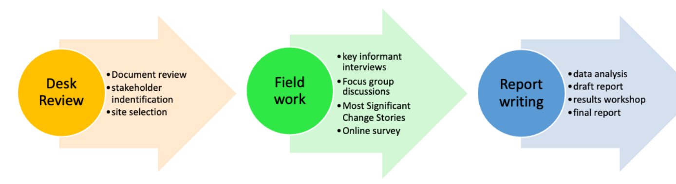
Figure 3: Evaluation process

The evaluation applied a mixed method approach, which employed theory based, cross-sectional mostly descriptive methods. The methodology was implemented in three stages: Document review, field work data collection and reporting stage.