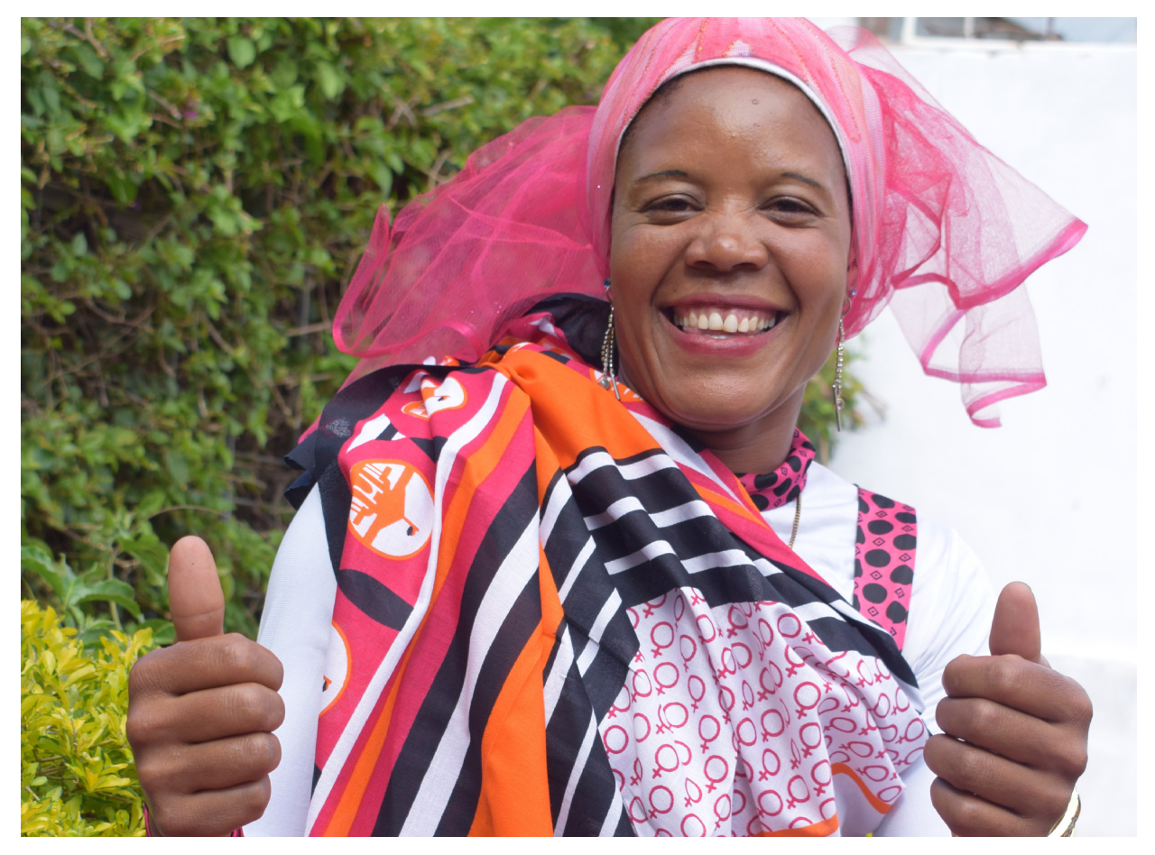
A team of Wanawake Sasa champions.