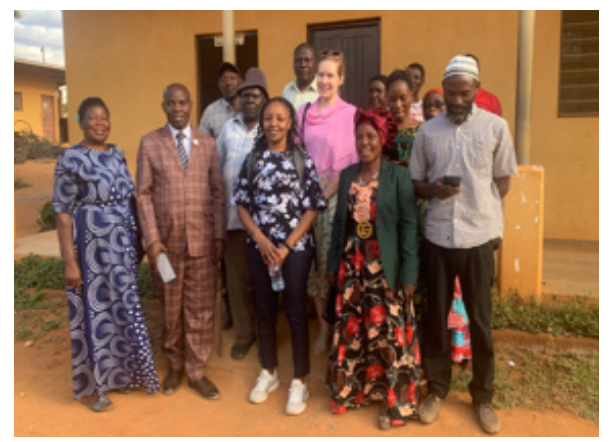
Focus Group Discussion with community influencers in Kongwa, Dodoma, 11 November 2022