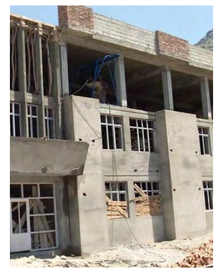
Two years' construction results at the Omara Khan School in Kabul

Helmand faced difficulties in construction, safety, usage and land deed acquisition. New construction tested the bounds of OTI's abilities, made even more difficult by the fact that OTI had no international engineers on staff. OTI-funded rehabilitation work was sometimes as problematic as new construction, but OTI has more flexibility when dealing with additional months to rehabilitate a facility, not additional years to complete new construction. Moreover, OTI should invest in rehabilitation to produce quality work since ministry buildings and schools are permanent government structures whose functionality will impact the legitimacy of a government for years.