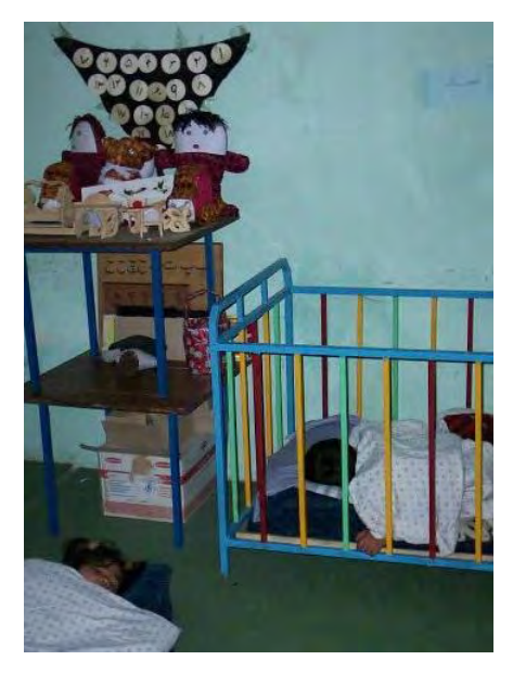
Children in Ministry of Agriculture and Livestock Kindergarten (donated toys on shelf)

and Culture, Rural Rehabilitation and Development, Reconstruction, Water and Power. The $55,000 committed, however, does not reflect a high level of commitment nor was it sufficient to fund high quality rehabilitation. Three years on, the repair work is unsatisfactory – with leaky roofs and pipes and broken door handles the norm. Much of the damage is not from normal wear and tear and appears to have been the result of low quality building repairs. Water supply was a problem in kindergartens visited at the Ministry of Agriculture and Livestock and the Ministry of Information and Culture. Neither kindergarten has a facility or room for washing and changing children even though there are 70 to 100 children per facility. Women at the Ministry of Agriculture and Livestock carry water to the building. Despite the difficulties, the Afghan women staff keeps the facilities remarkably clean.