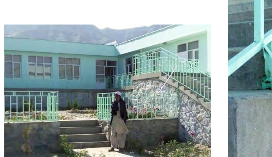
Parwan Provincial Women's Center

Women's programming received about five percent of overall support in this final phase of OTI programming. Grants were mostly for small-scale income generation training. A $3,000 grant to make toys for kindergartens was also approved. The toys were welcomed at the centers, but the publicity surrounding the distribution of the toys far outweighed their economic and social value.<sup>35</sup> The Ministry of Women's Affairs received $11,000 to celebrate International Women's Day 2004, and rehabilitation work began on the women's center in Faryab province. The WRC represented the largest grant targeting women – $60,000. The WRCs left unfinished as of June 30, 2005 were handed over to USAID for completion.