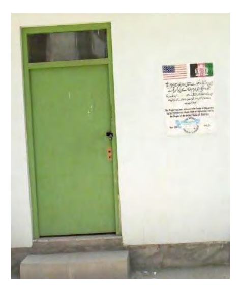
Non-functional toilet facilities with locked door and missing door handle at the Kabul courthouse

The objective of 'increasing women's participation in the political process' could have been one of the most important aspects of OTI programming and included a two-pronged approach to separately target urban and rural women. The small and sometimes confusing approach to income generation projects, the most common way OTI and IOM tried to include rural women in projects, expended time and money that could have been programmed for more targeted results. Additionally, had provincial MoWA offices and local women-led NGOs, upon whom